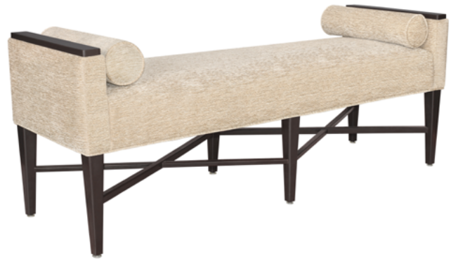
Model: ANBNBB211 60W 20D 23H 44SW 20SD 19SH 23AH

Antillo Bench with No Back is offered in 4 sizes and features an upholstered seat, boxed on the sides. Available with or without arms, arm caps, piping and bolster pillows. The classic legs and crisscrossed underframe deliver contemporary glamour. The bolster pillows are attached but can be easily removed for cleaning.